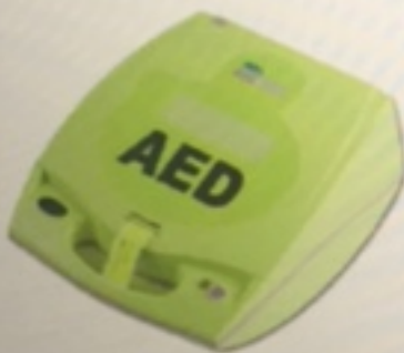
ZOLL Medical AED Plus

On Site Realistic Scenario Based Training www.accuratecpraed.com